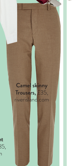
Camel skinny Trousers, £35, riverisland.com