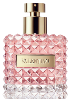
Valentino 'Donna' eau de parfum, £96.50, thefragranceshop.co.uk