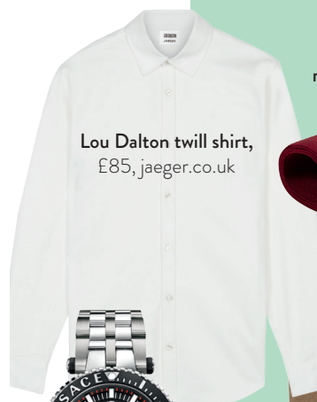
Lou Dalton twill shirt, £85, jaeger.co.uk