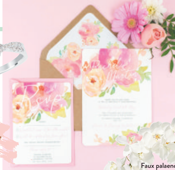
Rose Bloom wedding invitation and RSVP, EPOA, Eliza May Prints at notonthehighstreet.com

Jazz up pale pastel outfits with stunning accessories. Bring on the crystals and make sure to add plenty of sparkles!