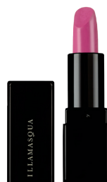
Glamore lipstick, £19.50, illamasqua.com