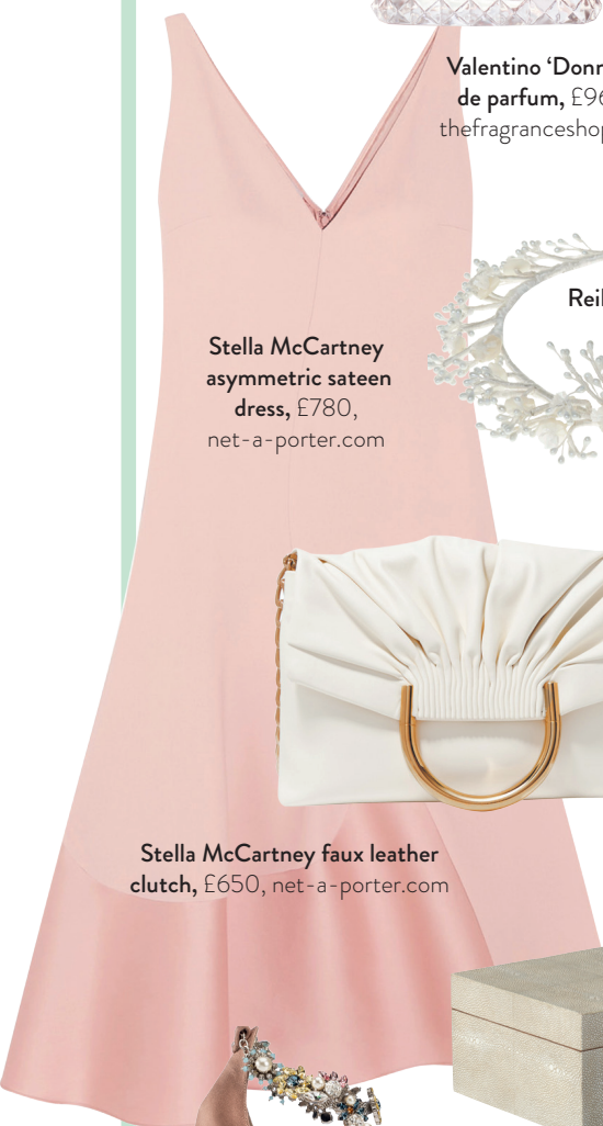
Stella McCartney asymmetric sateen dress, £780, net-a-porter.com