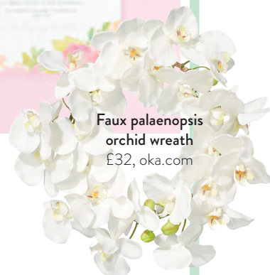
Faux palaenopsis orchid wreath, £32, oka.com