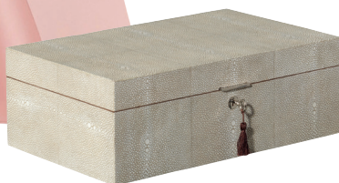
Faux shagreen memory box, £350, oka.com