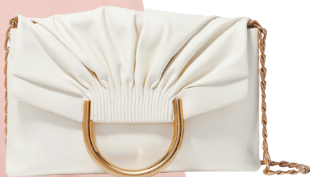
Stella McCartney faux leather clutch, £650, net-a-porter.com