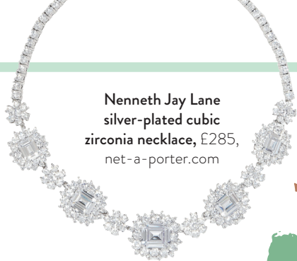
Nenneth Jay Lane silver-plated cubic zirconia necklace, £285, net-a-porter.com