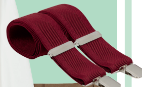
Osborne wine ribbed braces, £22, debenhams.com