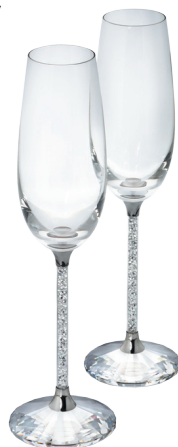
Crystalline toasting flutes, £249, swarovski.com