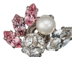
Spring camellia shoe clips, £85, jimmychoo.com