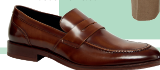
Jeff Banks patent leather loafers, £85, debenhams.com