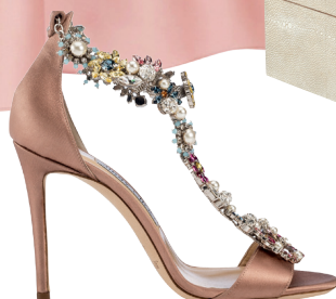
Dusty rose satin sandals with camellia mix anklet, £2,995, jimmychoo.com