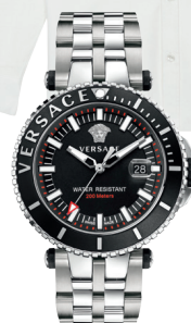
Versace 'V-Race Driver' stainless steel watch, £1,200, selfridges.com