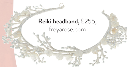
Reiki headband, £255, freyarose.com