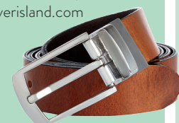
Brown reversible Italian leather belt, £24, riverisland.com