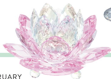
Waterlily candleholder, £125, swarovski.com